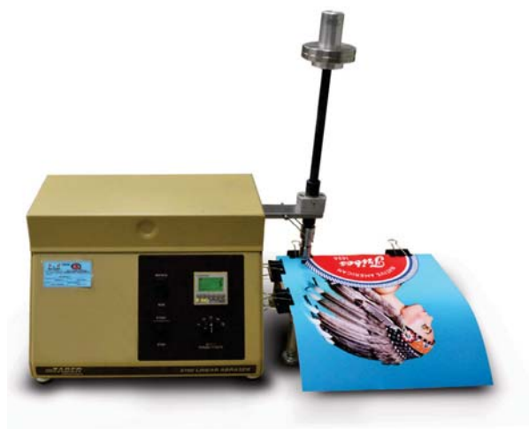
Figure 1 Scratch and abrasion testing are performed using a Taber tester, according to industry-standard test methods. 5

HP tests scratch and abrasion resistance using a Taber tester (Figure 1) and according to industry-standard test methods. 5