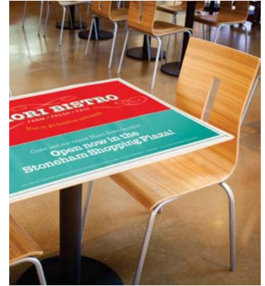
Water and chemical resistance