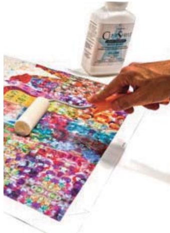
Liquid lamination on canvas