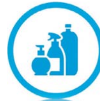
Water and chemical resistance