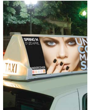
Economical liquid lamination on fleet graphics