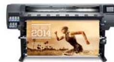
HP Latex 360 Printer Meet high quality standards at high speed