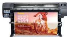
HP Latex 330 Printer Gain affordable access to indoor and outdoor signage