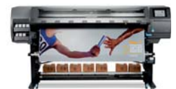
HP Latex 370 Printer More unattended printing at lower cost of operation