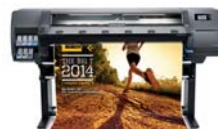
HP Latex 310 Printer Your entry option to outdoor— and a perfect fit for small spaces