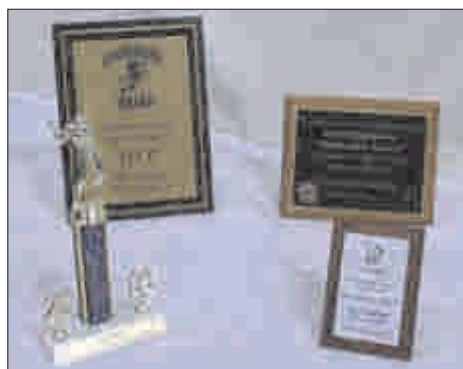
FlexiBrass & FlexiColor Sign Kit item #9030

FlexiColor® is a vivid extension of the popular FlexiBrass collection. Both products are available with or without adhesive.