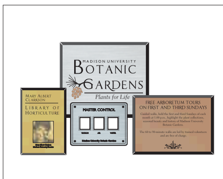
Metalgraph Plus™ Sign Kit item #9051

Ideal for interior and exterior signage projects, Metalgraph Plus is a product that is sure to make your clients say, "Wow!"